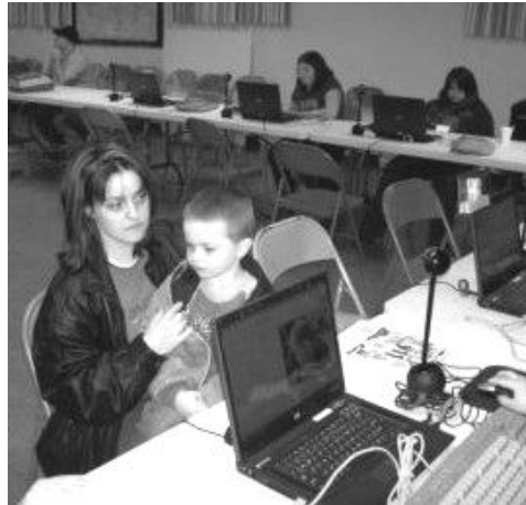
(photo above) Young mom giving input to computer operator entering data for CHIPS CD disk and laminated ID card.