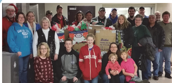
These cheery faces greeted each of the Veteran's Hospital patients and delivered what many said would be their only Christmas gift.

30 different people from Swope Park Lodge #617, Swope Park Chapter #520 OES, William F. Kuhn DeMolay, Bethel #1 Job's Daughters and Harry D. Brown Jr Chapter Royal Arch Masons were there to arrange socks, and stocking hats.