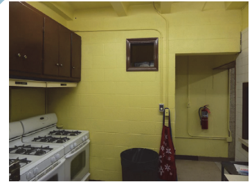
Among the many improvements was a fresh coat of paint on the walls of the kitchen, dining room, and on the front door.