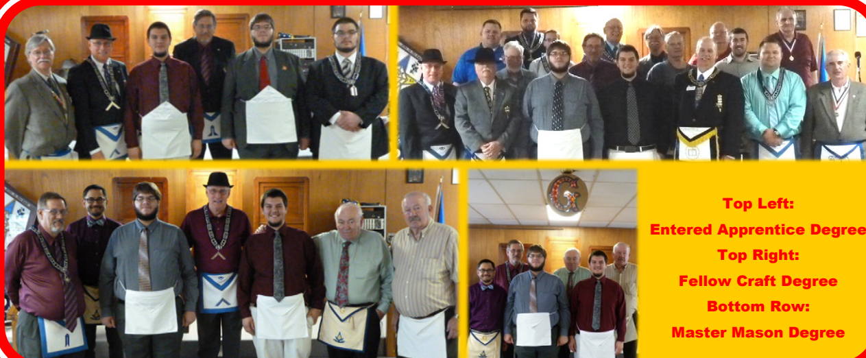
Top Left: Entered Apprentice Degree Top Right: Fellow Craft Degree Bottom Row: Master Mason Degree