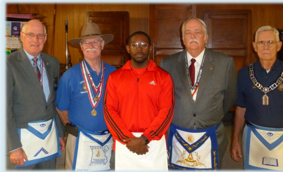
After Lodge closed the Brethren in attendance retired to Shotwell Hall for a full spread of refreshments consisting of pulled pork sandwiches, potato